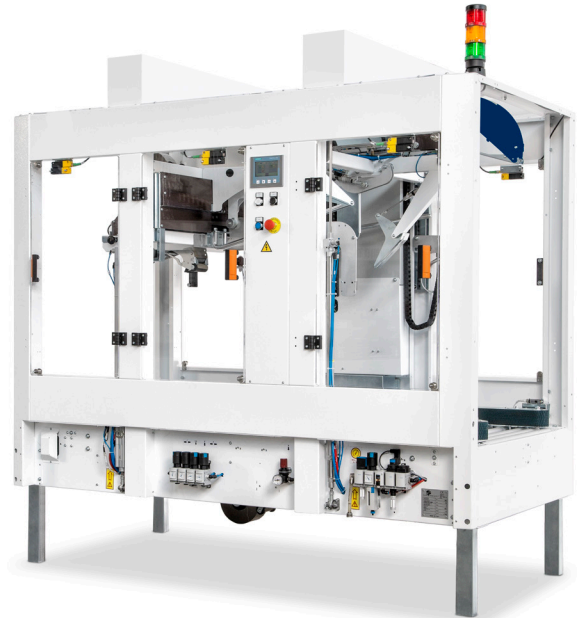
Standard version of the CT 305 SDRF