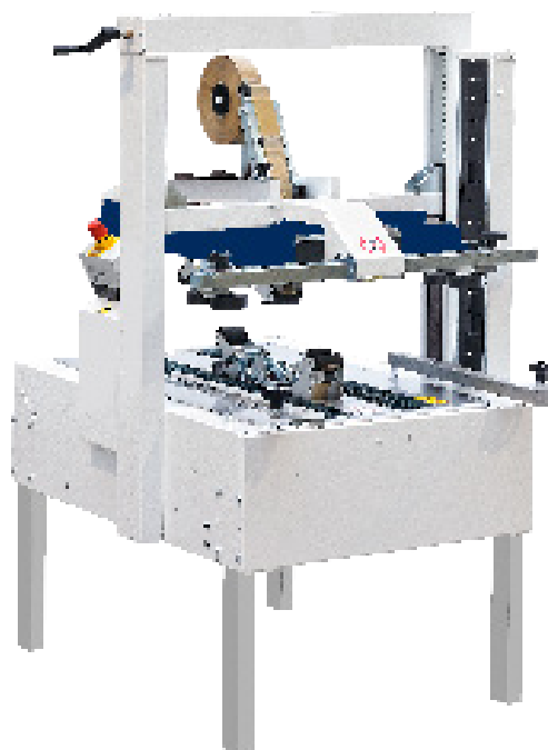
Standard version of the CT 303 TB