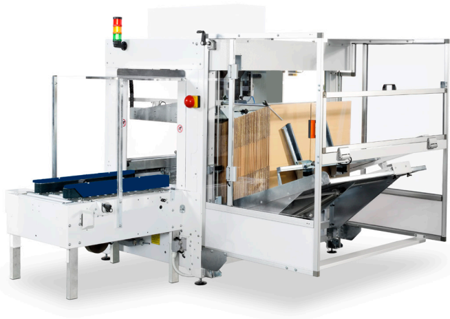
CT 302 SD with carton erector CT 3000