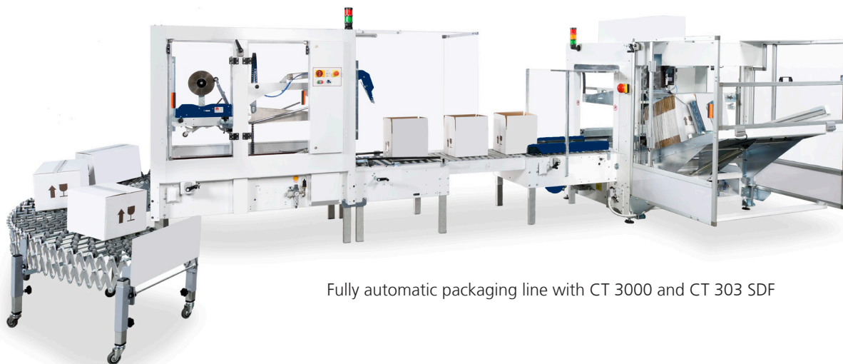
Fully automatic packaging line with CT 3000 and CT 303 SDF

With the CT 3000, it is possible to professionally erect thousands of cartons per day.