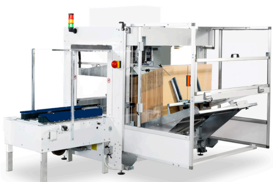
CT 3000 with bottom sealer CT 302 SD