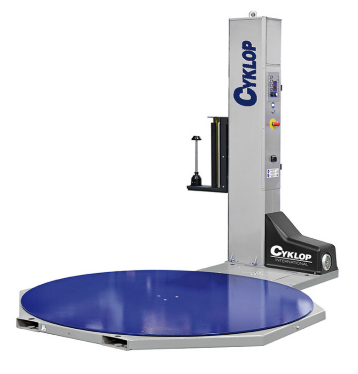
> Click here for a video of the CST 201 <