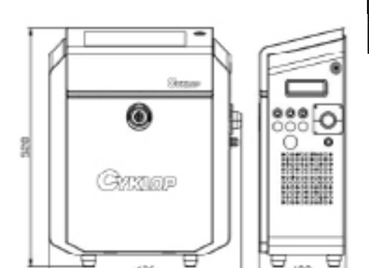
Cyklop UK Limited Unit 2, Generation Business Park Barford Road St. Neots, Cambridgeshire PE19 6YQ